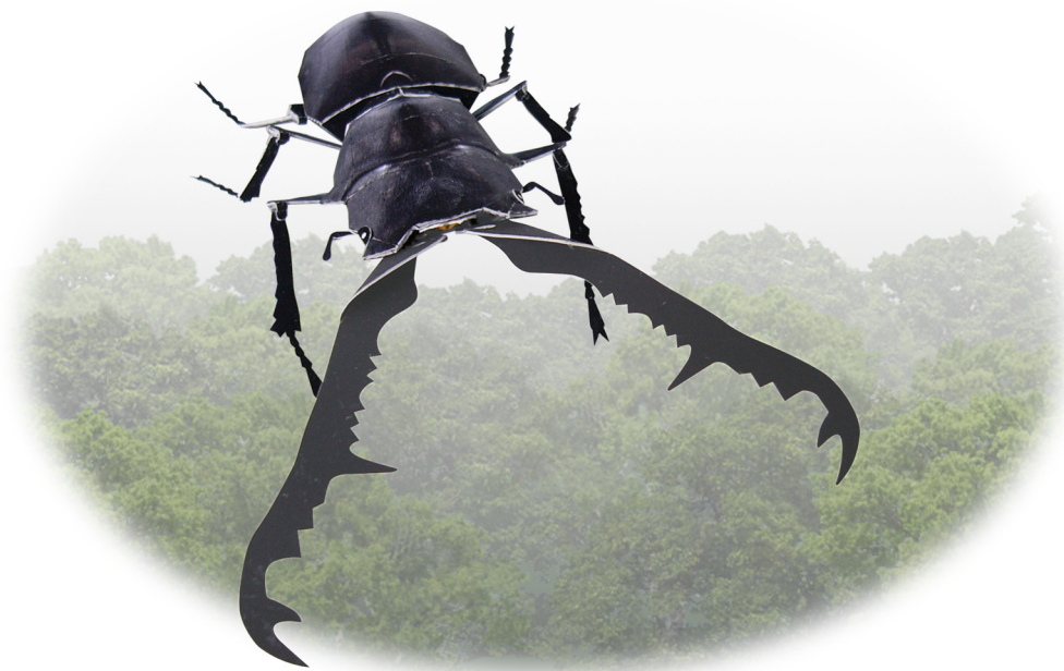
View of completed model