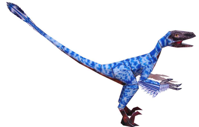
View of completed model

Total length : 90 cm ; weight : approx. 3 kg ; taxonomy : order Saurischia, suborder Theropoda, family Dromaeosaurus Period : Early Cretaceous period (approximately 80 million years ago) ; habitat : the Americas